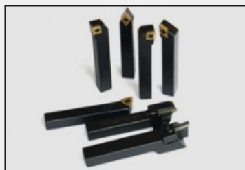
Cutter set (tips replacement)12x12mm