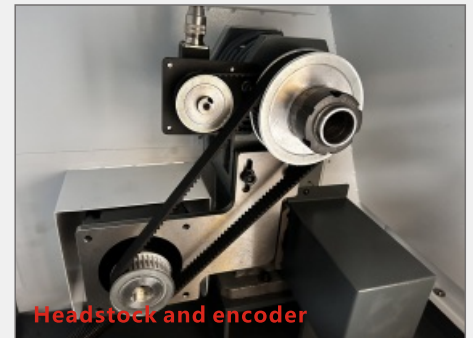
Headstock and encoder