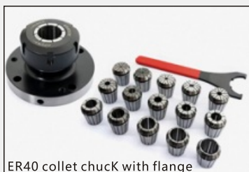
ER40 collet chuck with flange Clamping range dia:2-30mm