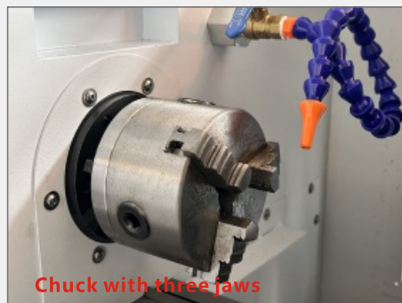
Chuck with three jaws