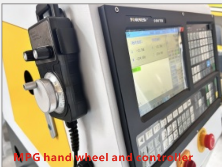
MPG hand wheel and controller